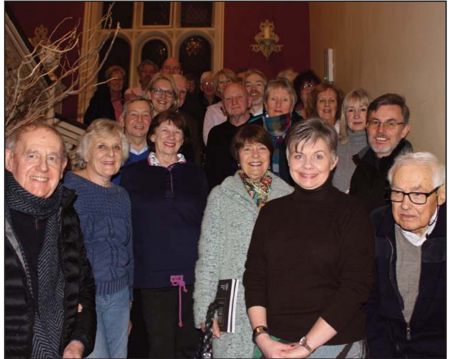
Photo: The delegates on the stairs at Woodborough Hall