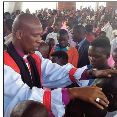
Confirmation of 336 people to cover expenses like accommodation.

Three students from the diocese are at Bujumbura Christian University getting theological education to degree level. They received scholarships so the Diocese provides pocket money