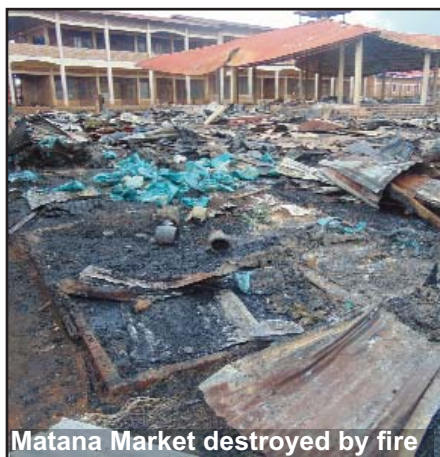
Matana Market destroyed by fire

The area around Matana is rural and so most people live by subsistence farming. Life is precarious and poverty levels are high. Income generation is essential for survival. The market is a hub for the community as well as being a place where business is carried out. People buy their daily supplies of food, clothes and shoes, school uniforms, exercise books and other school materials, baskets, furniture and many other essential items. It is where parts for cars can be found and bicycles repaired.