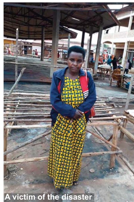
A victim of the disaster

Helping to bring restoration in practical ways in the face of seemingly endless challenges is