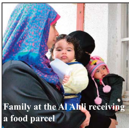
Family at the Al Ahli receiving a food parcel