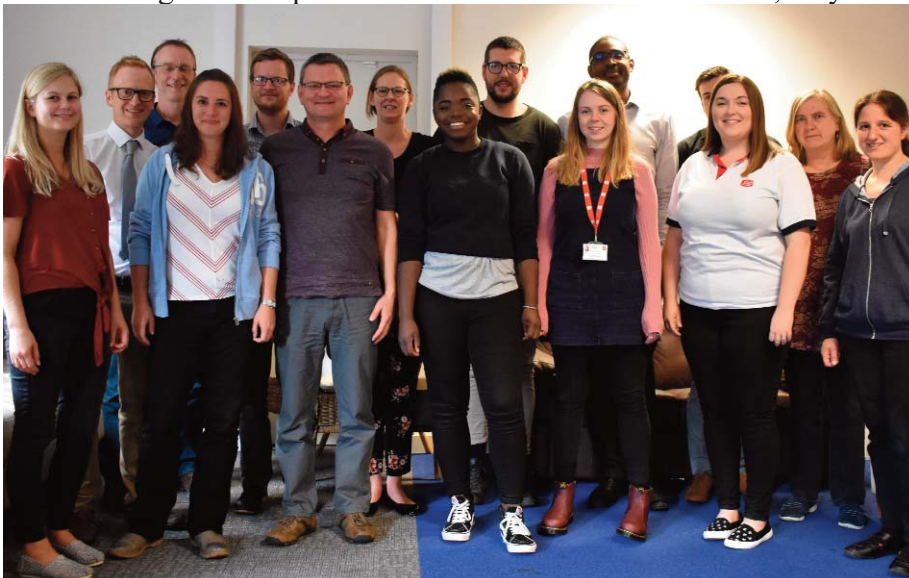
Faith Action Nottingham